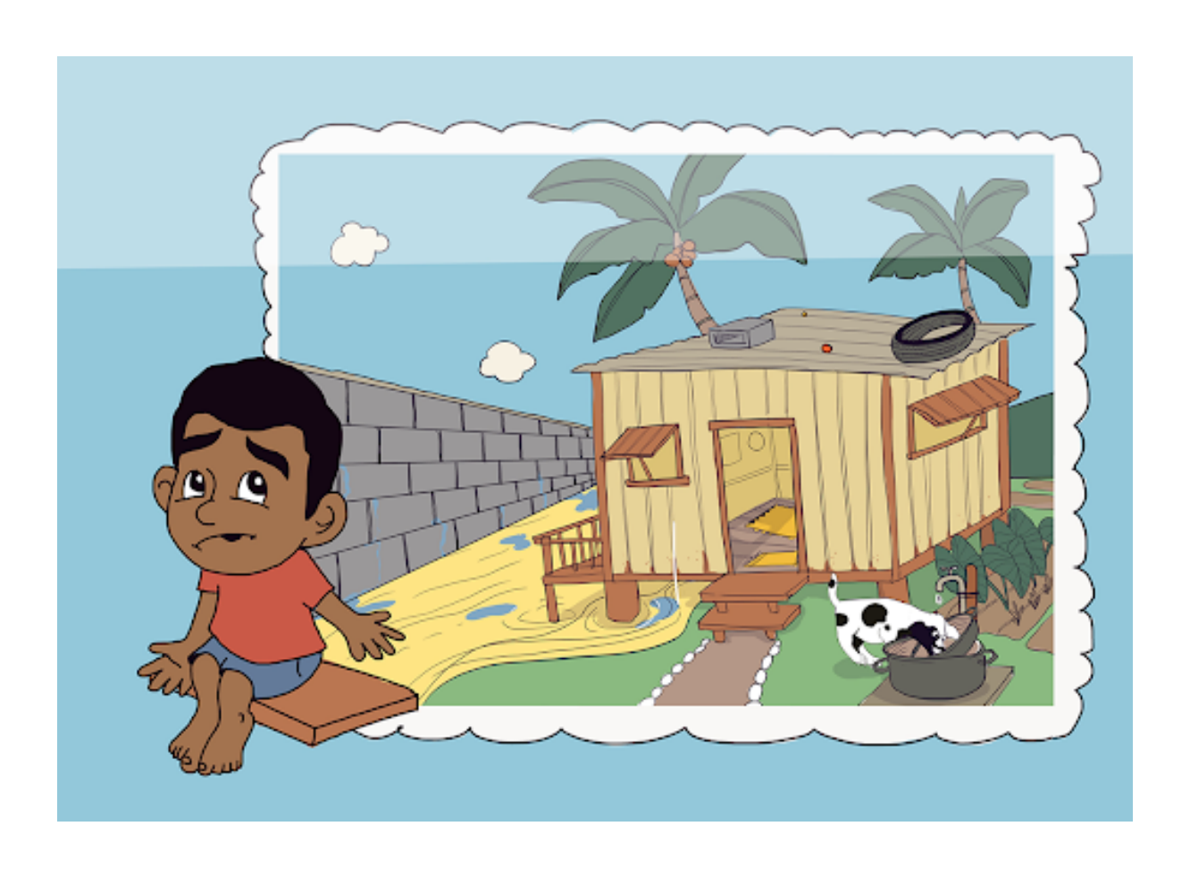
"What are we going to do?" asked Maku. "Could we build a wall to keep the sea away?"